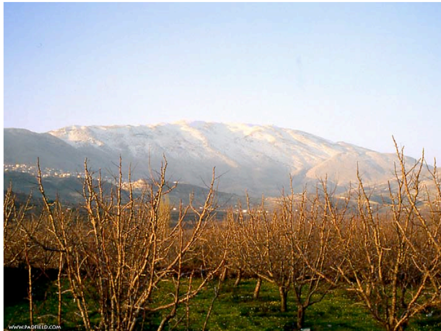
Mount Hermon, Probable Site of the Transfiguration